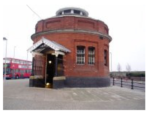
Woolwich Foot Tunnel, north entrance