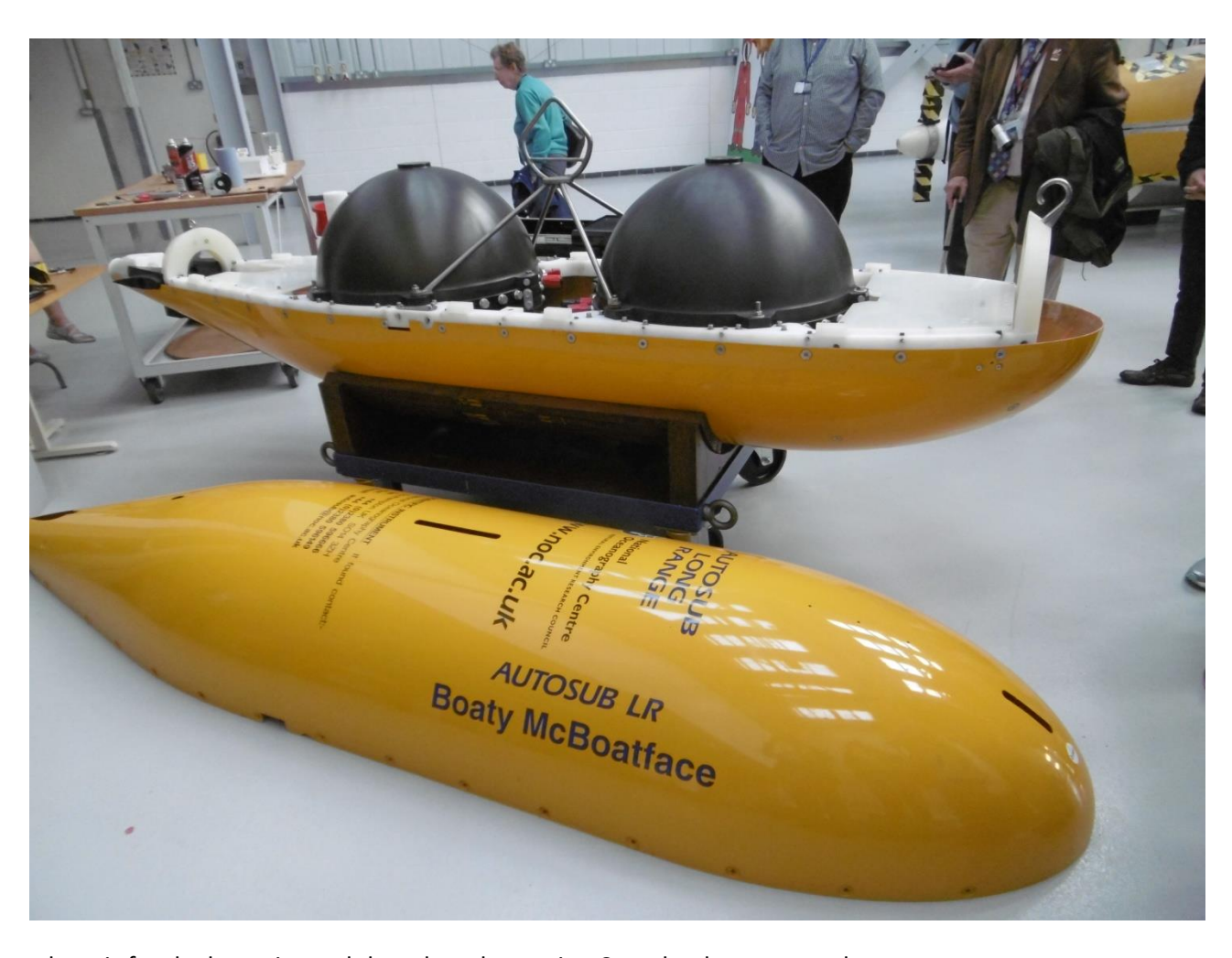
One sphere is for the batteries and the other electronics Completely automated.