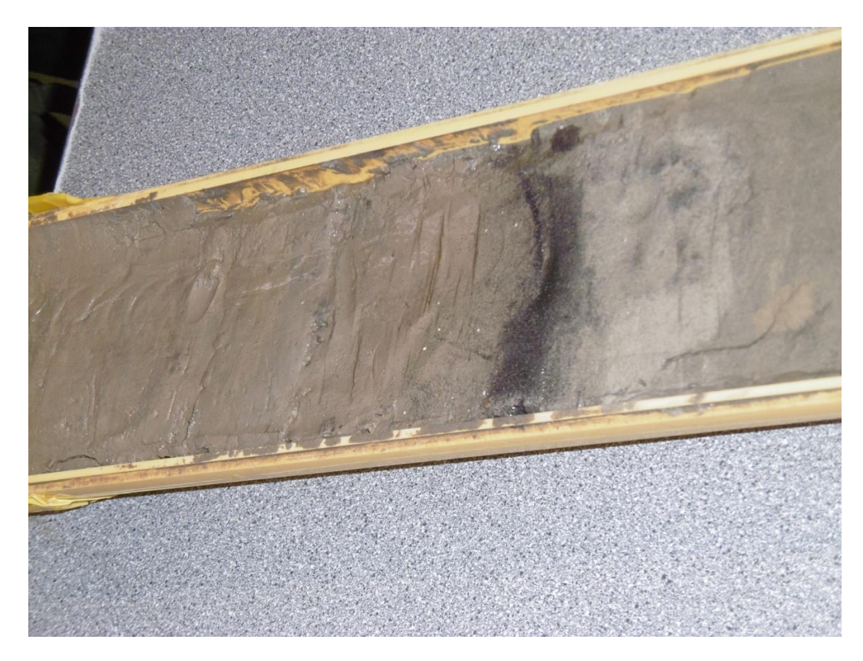
A core sample showing a tsunami 44,000 years ago between Norway and Iceland on the sea bed of less than 0.5 degrees.