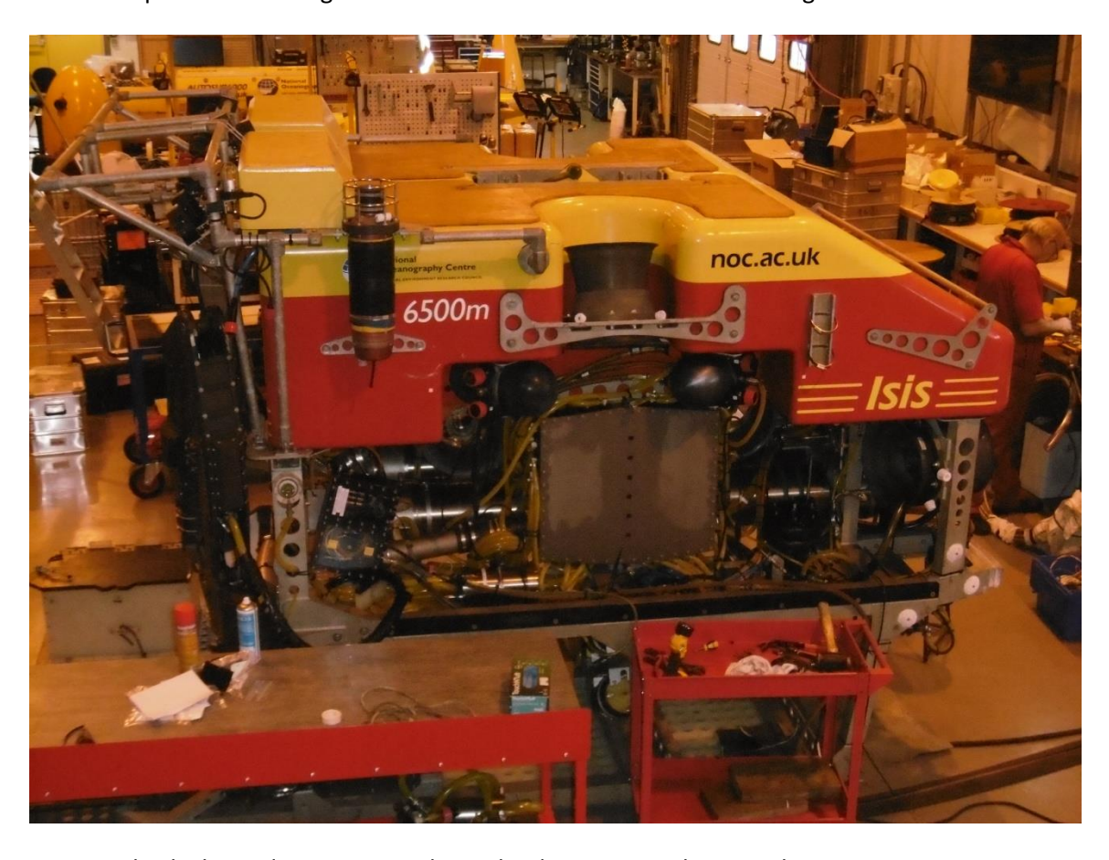
Deep sea automated vehicle ready again to go down the deepest trench on Earth