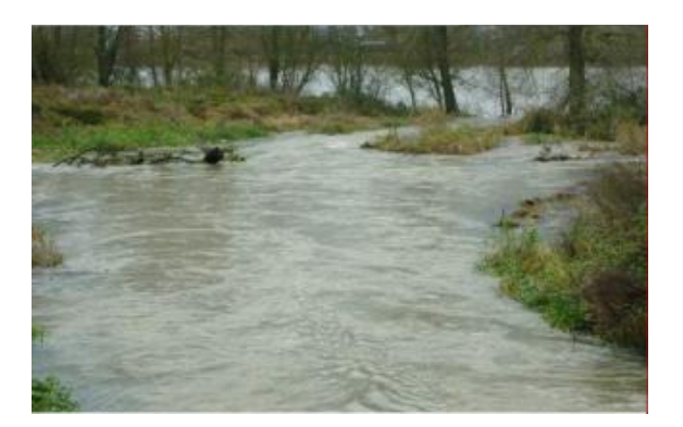
In flood at Somerford Keynes