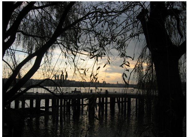
Until in London – looking upstream towards Greenwich